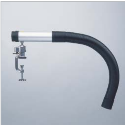
5A3B0-0000-AF07 Extraction arm 3046