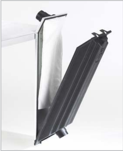
PF-00-0000 Prefilter PF-00-0F07 Prefilter with arm (picture without arm)