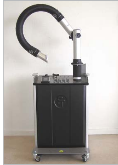
950-3202-ESD Mobile unit for MG75 and MG95 with console for extraction arm (unit and arm not included)