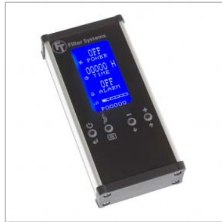
700-3058 Remote control (battery) IR